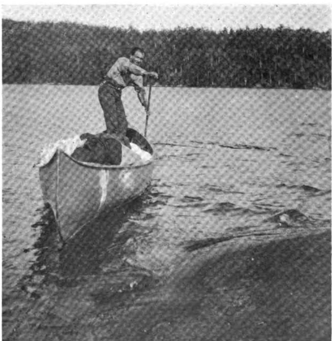
Canoeing in the Adirondack lake with a folding canvas canoe

Assuming that you are a youth, with $100 or less for your two or three weeks vacation, your folding canvas 9-foot boat and tent top would cost you $36 for all the outings you are ever likely to make while young. To this add the amount of carfare. If you are to camp, there is so much to be apportioned for food, utensils for cooking and eating (which may be had at the 10-cent store), fishing tackle and perhaps a gun and shells. The gun and shells must be dispensed with unless you can afford a State license and unless you are to camp in the season when shooting is allowed by law. As a rule, two or more combine on a boating camping trip, dividing and thereby reducing the expenses and sharing the camp work. Those who have experience and can afford it may take along a man of all around ability, who will attend to all the camp drudgery. Say what you will, the proposed camper of small means can do far better with a canvas boat, by going where he can board at a farmhouse or small hotel at from $3.50 to $5 per week. The expense is less, and the outer has all of his time to wrestle with nature for pastime and relaxation.