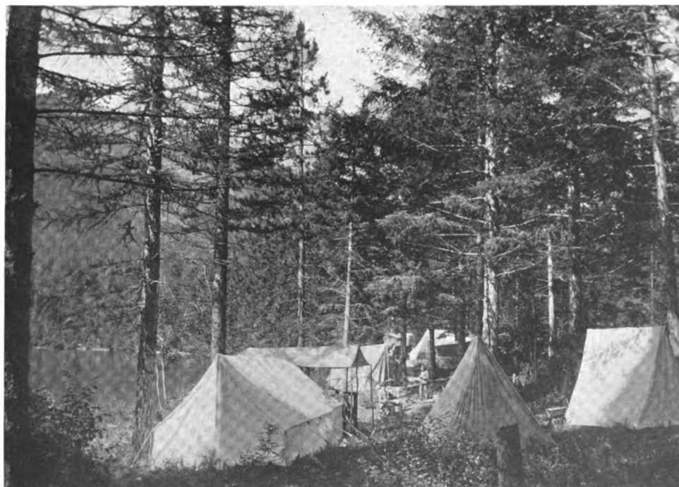
A large fishing party in camp by a mountain lake

Canvas boats are now made life-saving; that is, they cannot be tipped over by one man standing anywhere upon them; if tipped over or filled with water by any cause, the smallest of them will still hold two people without sinking. It takes only five minutes to set one up or fold it up. It can be rowed twice as fast with only one-half as much arm power as a wooden boat requires. It is less expensive than a wooden boat. It has life-saving air chambers, double paddles or jointed oars, carrying ease, combination thwart seat, spreaders, oarlocks and camp chairs. It may also