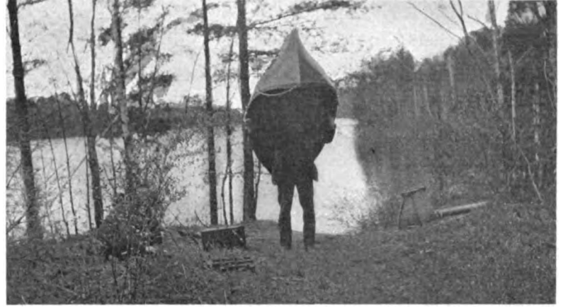
Carrying a folding canoe set up in the water