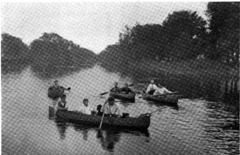
Making ready for a landing for the night