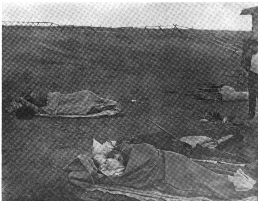
The expedition sleeps at a flying camp